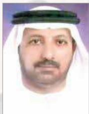
H.E. Musabah Al-Kaabi

TESOL Arabia International Conference and Exhibition, LLC