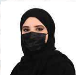
SHEIKHA MARYAM BINT MOHAMMED BIN AHMAD AL MAKTOUM

TESOL Arabia International Conference and Exhibition, LLC